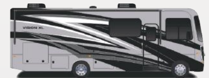
Logan Full-Body Paint