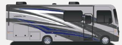
King Full-Body Paint