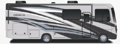
Fairweather Full-Body Paint