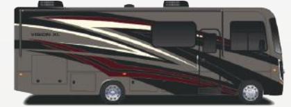
Foraker Full-Body Paint